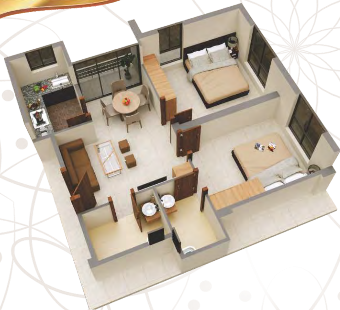
3D DRAWING OF 2 BHK FLAT