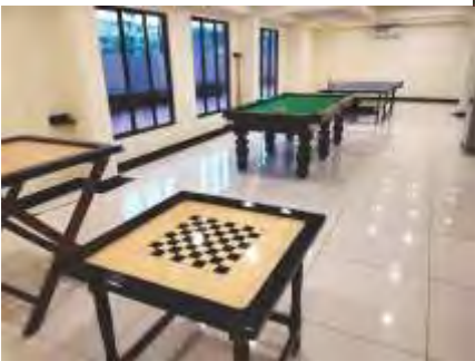
Indoor Games Room