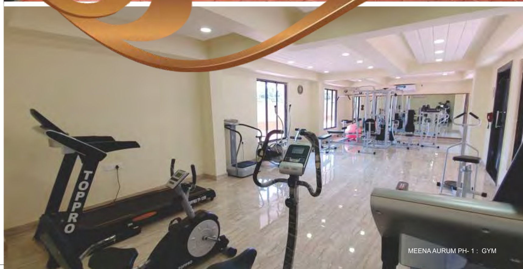
MEENA AURUM PH- 1 : GYM