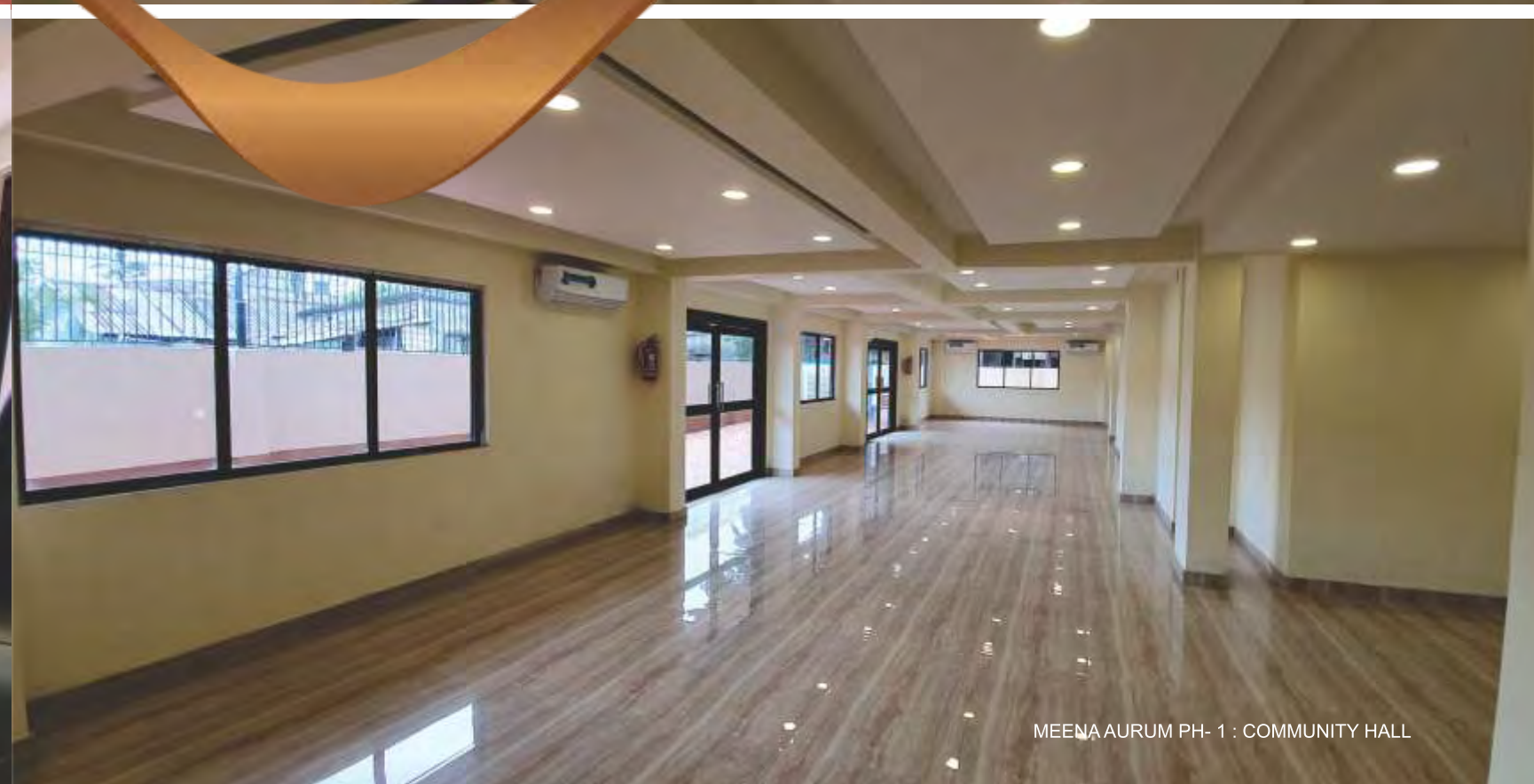
MEENA AURUM PH- 1 : COMMUNITY HALL